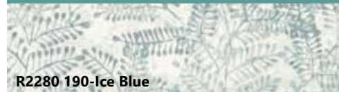
R2280 190-Ice Blue